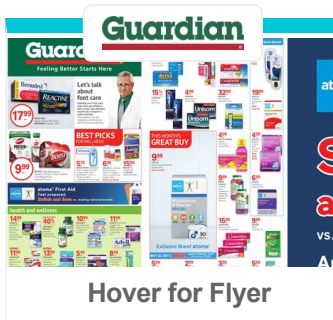
Hover for Flyer