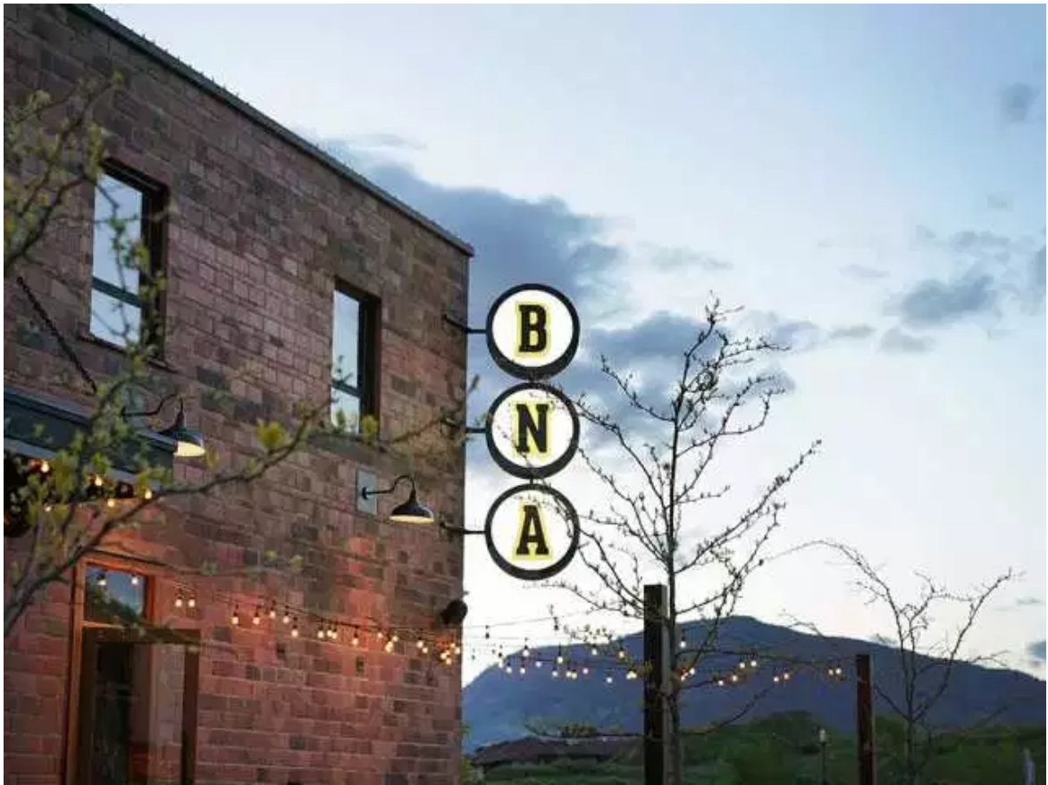
BNA Brewing Co. is an independent craft brewery with an onsite Tasting Room and eatery.

BNA's share plates and craft beers are fantastic, but what delivers for children is the atmosphere—a giant taxidermy moose head greets them from behind the bar, and antique furnishings throughout contribute to the homey feel. Upstairs, you can try 10-pin bowling for $45/hour for one lane on weekend nights (save $10 by bowling Sunday-Thursday).