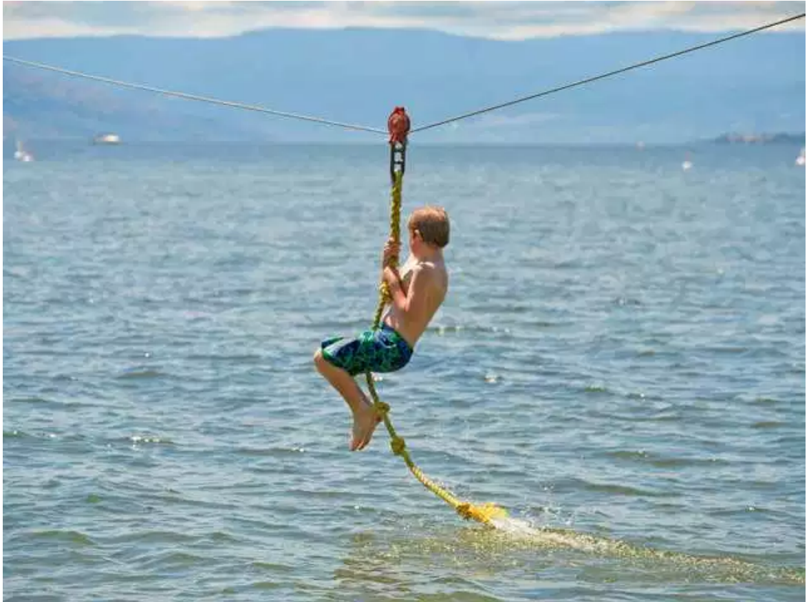
The zipline at Gyro Beach.

south and, across its expanse, the rounded hills of the Okanagan Highlands meet puffy white clouds and a sky just a shade lighter than the steel blue water.