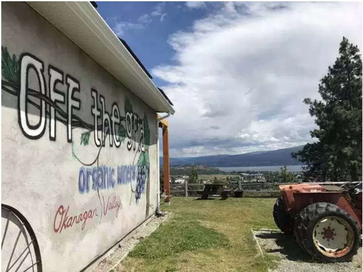
With its resident goats and turkeys, Off The Grid Organic Winery in West Kelowna makes a great post-hike stop for families.

Days like this one are the reason we moved to Kelowna, and it's the mix of outdoor adventure and culture that makes the valley a magnet for vacationers.