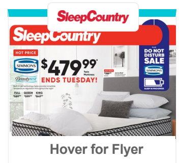
Hover for Flyer