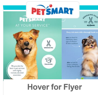
Hover for Flyer