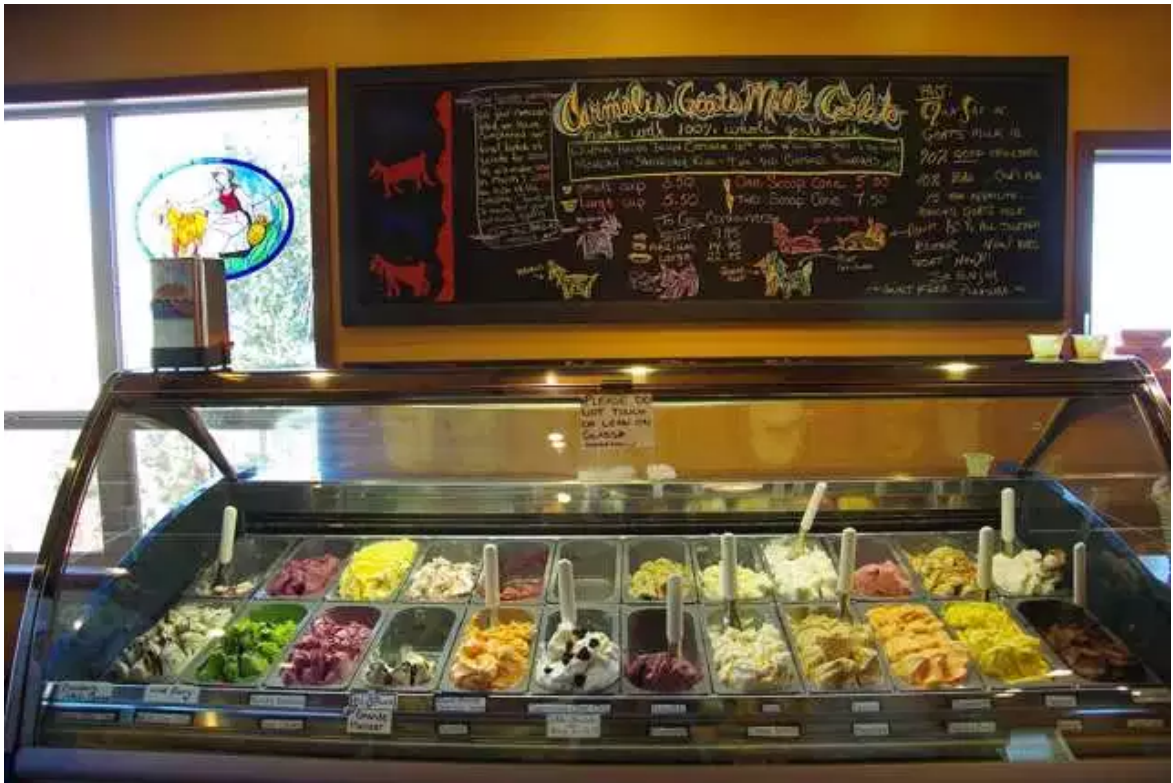
Carmelis Goat Cheese Artisan in Kelowna.

Stop at St. Hubertus & Oak Bay Estate Winery on the way back to town to pick up a bottle of the Frizzante Rosé ($18.50); it's lovely served chilled after a hot summer day. Children are welcome to pet September, the friendly winery cat, and pluck grapes from the vines located just outside the wine shop.